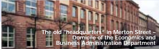
The old "headquarters" in Merton Street – Domicile of the Economics and Business Administration Department

Frankfurt University is located on four main campuses.